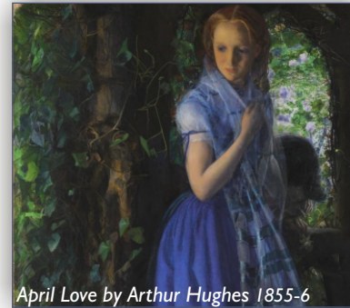
April Love by Arthur Hughes 1855-6

Quiz Answers: 1.Nitrogen 2.Swiss 3.Gills 4.Seagull 5.Echium 6.Poached Egg Plant 7.Rose of Sharon 8.Agave 9.Cosmos 10.Endive 11.Malice 12.Calcium Nitrate.