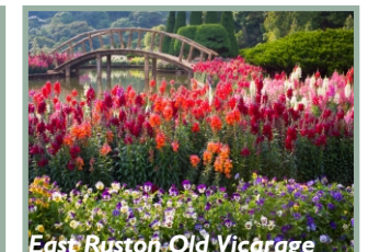
East Ruston Old Vicarage